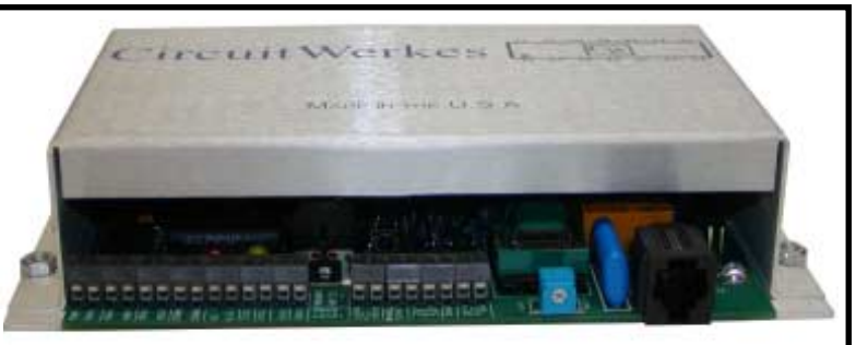
Optional single or dual rack mount available

The CircuitWerkes HC-3 autocoupler is designed to more effectively meet the varied needs of today's modern broadcast or production facility. The HC-3's versatility makes it the best all around choice for your telephone needs. The HC-3's features include the following: